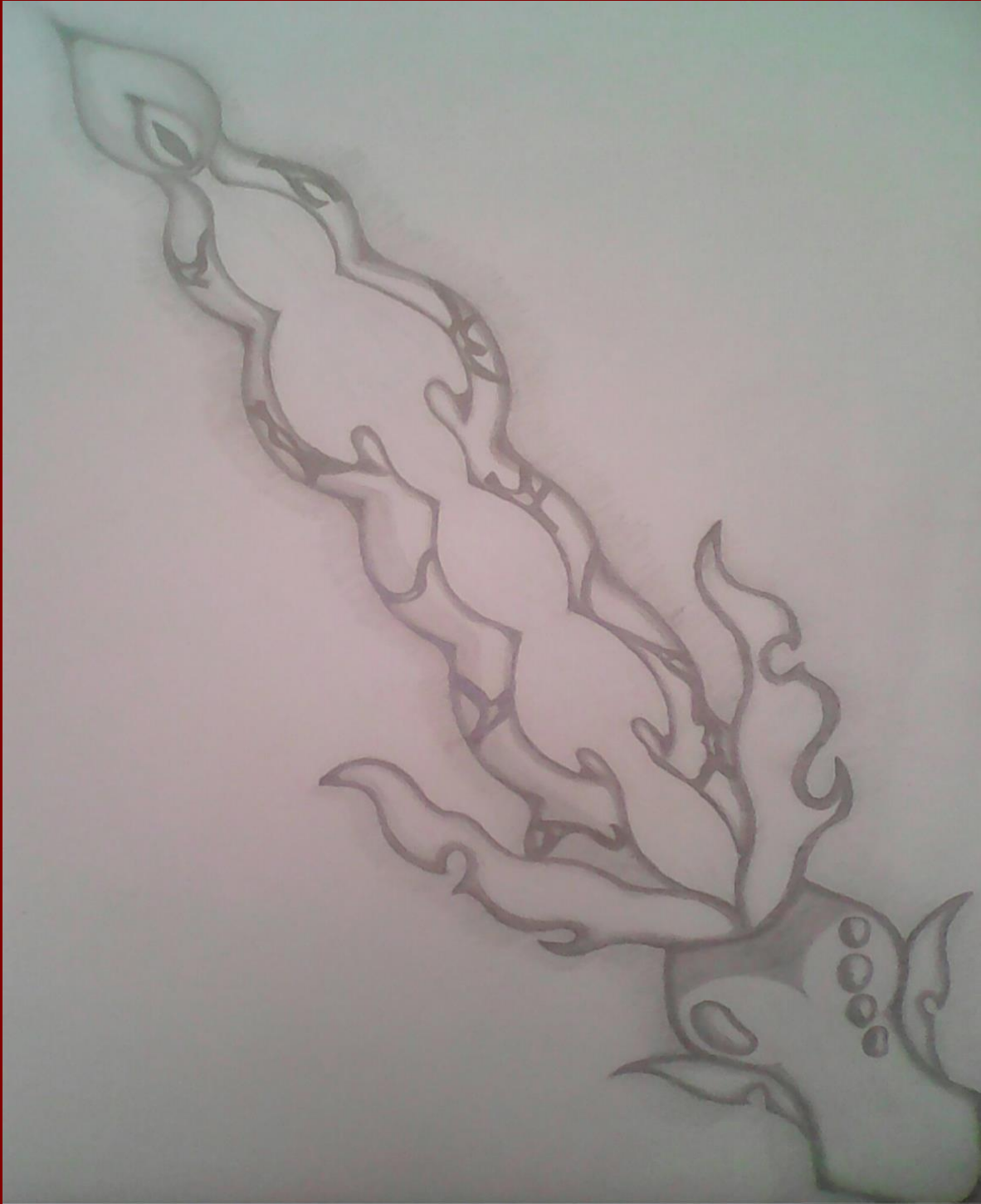
By: Virginia Wamukoya