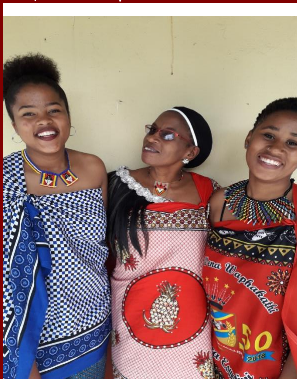
Look at those hotties! You gotta love culture for bringing out the beauty in people...