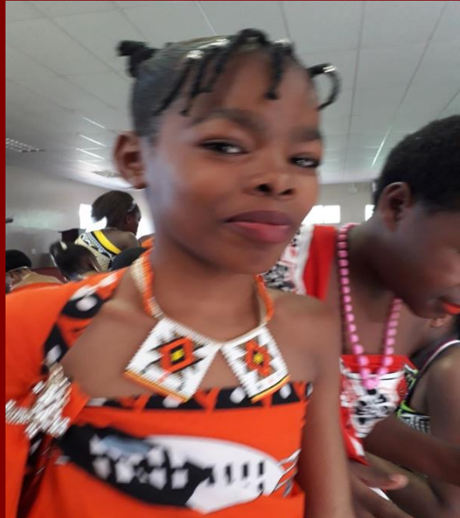
Check out this girl, she's looking good in her Regalia!