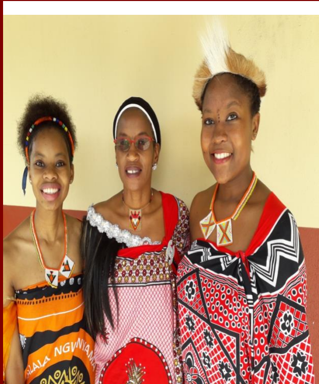
Who would deny our culture when it brings us all together? It is unusual for teachers to take pictures with students but our culture doesn't bring out teachers but parents who want to be with their children in these times...