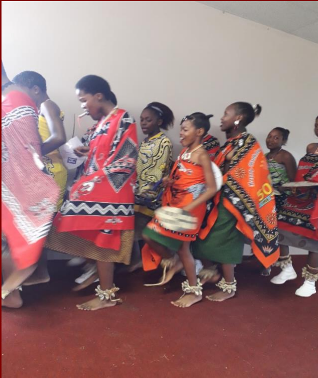
The girls leaving the stage after a splendid performance!

Every year the school hosts a culture day to promote our culture and remind us that we are emaSwati despite the uniform that we wear every day. We get a chance to wear our traditional attire and have a traditional day full of traditional songs, dance, and of course the best traditional food that the school offers us at the end of the day.