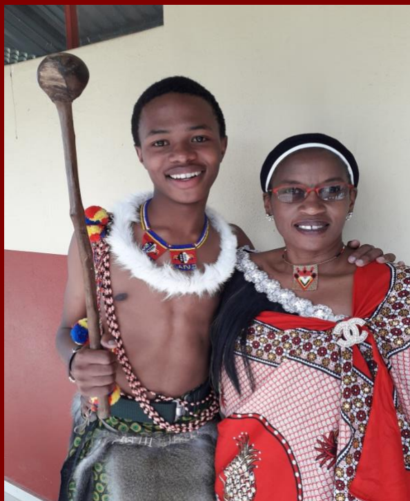
Check out that guy, I hope he doesn't hurt anyone with that knobkerrie! And the smile on mam, she must be proud.