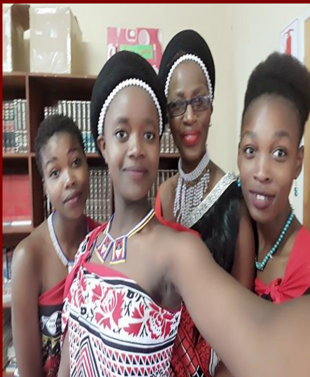
Check out them ladies! Now that is the true definition of culture!!