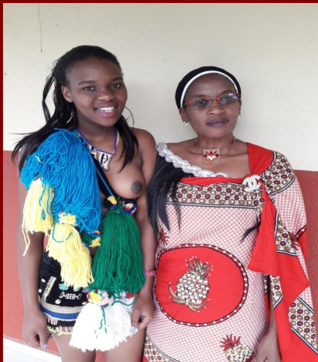
Now that is true culture! A mother and a daughter in their traditional attire with beautiful smiles as a cherry on top...