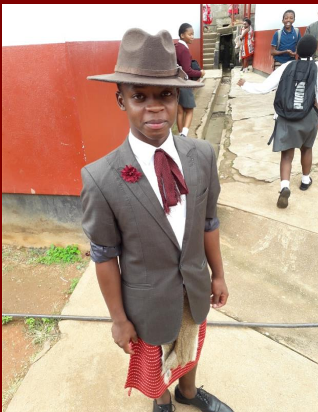
I don't know about you guys but I've come to notice that this guy's style makes him stand out in every crowd (That is amazing!)