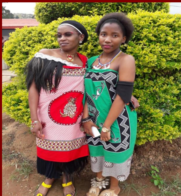
Our colours blend well with nature, bright as they may be, they bring out the beauty in us...